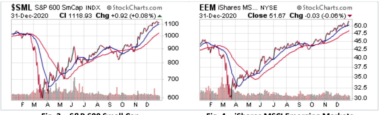
Fig. 3 – S&P 600 Small Cap Fig. 4 – iShares MSCI Emerging Markets

The past quarter saw a change in market leadership, as both small cap stocks ( Figure 3) and emerging markets ( Figure 4) outperformed the S&P 500. This pattern may persist in 2021. Small caps are more sensitive to the reopening of the economy and may offer more attractive valuations after several years of trailing the large cap index. Similarly, emerging market stocks generally trade at lower multiples than U.S. companies with comparable fundamentals. In addition, some emerging economies, including China, Taiwan, and South Korea, have handled the pandemic much more effectively than the U.S., and are expected to grow faster in 2021. A diversified portfolio with exposure to these segments as well as the recent U.S. leaders may serve investors well.